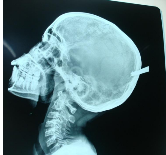
Fig. No.3: Penetrating foreign body in Occipital region