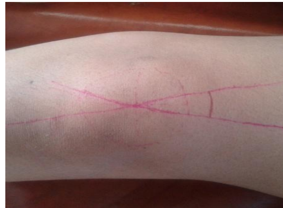
Fig. 1. Q Angle Measurement

straight edge of measuring tape. The second line was drawn from the tibial tuberosity (TT) to the CP. Then extending the second line upwards, the angle formed between these upper two lines were measured using a standard goniometer as the Q angle. Measurements were taken once by a single investigator. Data was analysed using appropriate statistical tests.