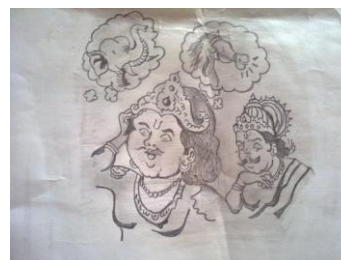
Figure 3 Photograph of drawing done by the boy depicting his problems