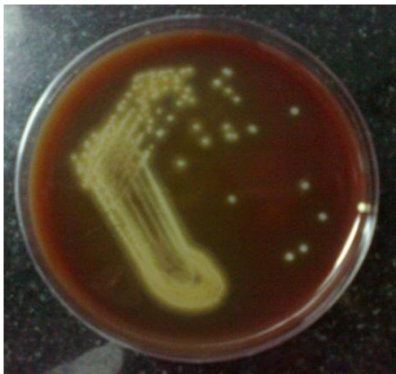
Figure 3: Blood agar plate showing \alpha -hemolytic colonies.

Gram's stain showed numerous WBCs and numerous Gram positive lanceolate shaped diplococci morphologically resembling Strep. pneumoniae . [Figure 2]