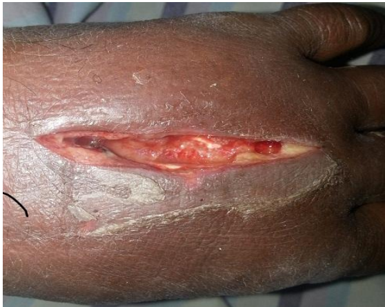
Figure 1: Cellulitis of the dorsum of the left hand.

On Local examination there was a diffuse swelling on the dorsum of the left hand. The skin over the swelling was