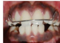
Figure 8: Anterior bite plane