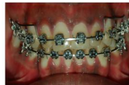
Figure 3: Utility arch Wire