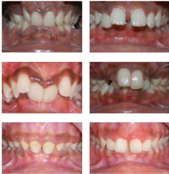
Figure 1: Photographs showing the different intraoral features of deepbite cases.