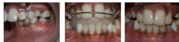
Figure 9: Case of class II division I deepbite treated with Activator.