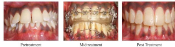
Figure 7: Surgical correction of deepbite

C) Surgical correction : Anterior segmental osteotomies and mandibular advancement can also correct skeletal deep bite. [13] Figure 7