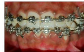
Figure 4 KSir Arch Wire