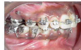
Figure 6: Micro Implants for Intrusion and Retraction

C) Utility arches: It was introduced in 1976. It is a continuous wire that extends across both buccal segments but engages only the first permanent molars and four incisors and is most commonly made of rectangular 0.016×0.016 inch stainless steel or 0.016×0.022 inch Elgiloy. It generates approximately 25grams of force per anterior tooth. Wire is activated by placing occlusally directed gable bend in the vestibular segment. A tip back bend also helps in intrusion of anterior teeth. It causes intrusion and possible torquing of the incisors as well as tipping back, of the molars. [8] Figure3