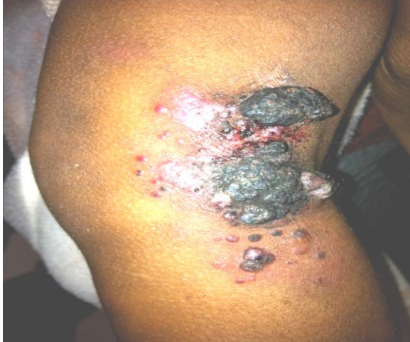
Figure 1: Hyperpigmented lesion over left leg