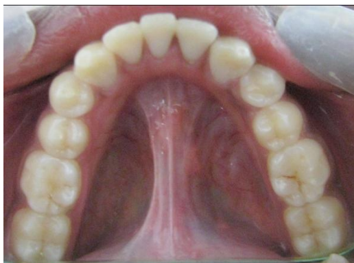
Fig 10. Congenitally Missing Mandibular Lateral Incisor

It is important to note that different races have different predilections for congenitally missing teeth. For instance, the most commonly missing teeth in the Asian dentition are the mandibular incisors.(Fig.10,11)