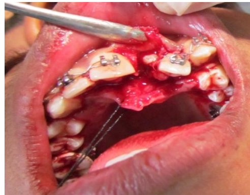
Fig 4.Surgical Exposure of Impacted Maxillary Central Incisor with orthodontic attachment for traction

This is usually the result of premature loss of the deciduous incisor tooth. Treatment of this type of soft tissue impaction consists of surgically making a "window" in the tissue at the incisal edge of the tooth and then the incisor tooth is allowed to erupt through the opening. It is sometimes necessary to bond an attachment to the incisor and use a traction force, applied either directly to the attachment or indirectly to the attachment via a chain or ligature wire.(Fig 4)