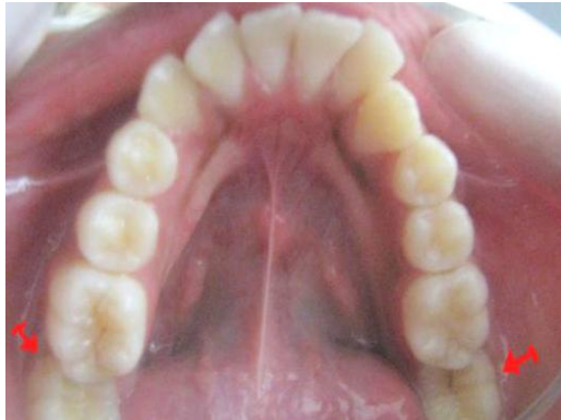
Fig 5. Impacted Second Mandibular Molar

Impacted mandibular second molars usually present with a unique set of problems. More often than not, the mesial marginal ridge of the second molar is "caught" below the distal contact of the first molar (Fig 5,6).