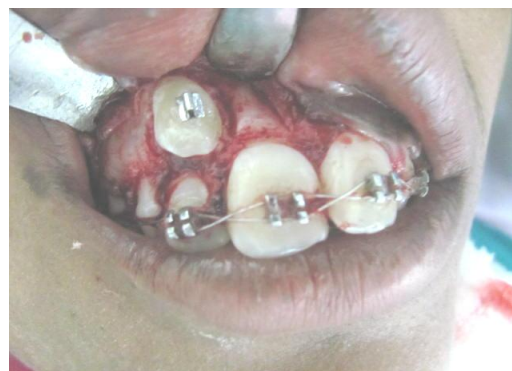
Fig 8.Surgical opening of Impacted Maxillary Canine With orthodontic attachment for traction

If the latter is not possible, then canine extraction may be the best treatment. If the canine can be moved to its normal position without passing in close proximity to other tooth roots or is actually moved from the vicinity of a resorbing root, then orthodontically moving the tooth is likely to be the best option with surgical innervations.(Fig 8).