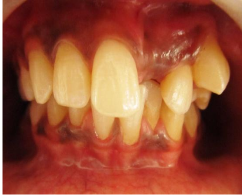
Fig 2.Impacted Central Incisor