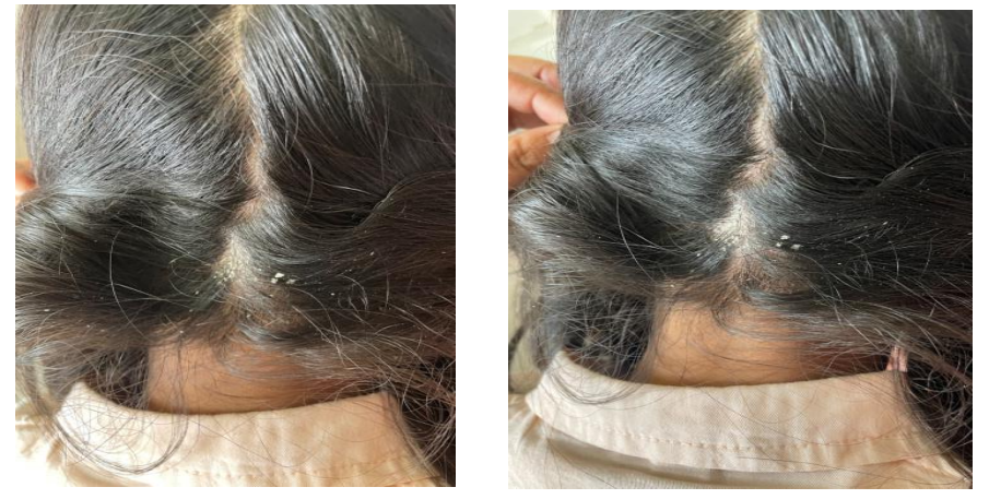
Fig2: Pictures Of Before Treatment

Pictures Before Treatment After Treatment