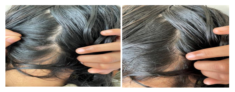
FIG 4: PICTURES OF SECOND FOLLOW UP

FIG 3: PICTURES OF 1<sup>ST</sup> FOLLOW UP