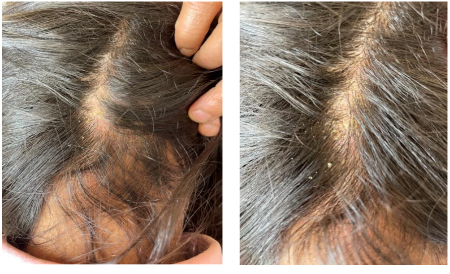
FIG 3: PICTURES OF 1<sup>ST</sup> FOLLOW UP