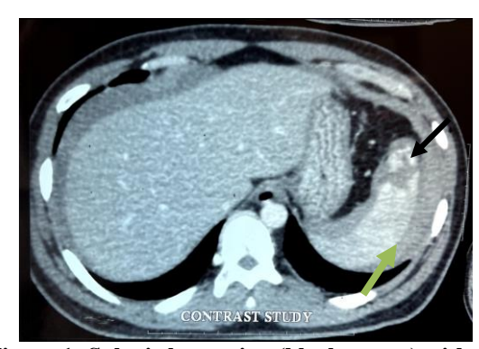
Figure 1: Splenic laceration (black arrow) with perisplenic haematoma (green arrow)

A 29 year old male patient had an RTA 2 hours prior to admission. On arrival at the casualty, patient was semi-conscious with tachycardia, tachypnea, hypotension with a GCS of E2V2M6. After initial resuscitation, CECT whole Abdomen was done which showed a laceration of 2.9×2.3 cm in the anterior aspect of upper pole of spleen with contusion. The was perisplenic haematoma of 15.4 mm in thickness (figure 1). So, it was splenic injury of grade 2. The patient was initially managed in ICU with antibiotics, antianalgesics with resuscitation with packed RBCs and fresh frozen plasma with strict immobilization and taking care for bedsores. Regular monitoring of vitals is done. The patient was shifted to ward a week later with return to mobilization and was discharged 7 days later. Follow-up was done at 2 weeks and 6 weeks.