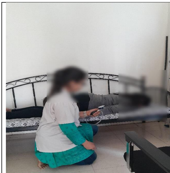
Abdominal Muscles Strength Assessment Stabilizer’s Pressure Biofeedback Unit

Interpretation- A normal reading would decrease by 6 to 10 mmHg during the abdominal contraction. The objective data of the test will show the activation of core stability muscles. The numerical readings that the Pressure Biofeedback Unit (PBU) produces will be employed in statistical analysis.