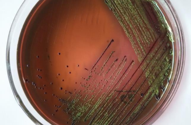
Figure 3 Figure 1 & 2- Selective isolation of Staphylococcus aureus and its Gram Staining Figure 3- E. coli showing green metallic sheen on EMB agar