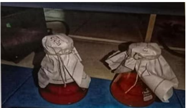
Fig. No 1: Preparation of culture media

Determination of antimicrobial activity: Agar cup plate method was used for screening of antimicrobial activity of alternifolia melaleuca Oil gel. All formulations of melaleuca alternifolia Oil gel of about 2% were placed aseptically in cups of agar plate which was previously inoculated with the culture. The plates were left at ambient temperature for 30 mins before to incubation at 37°C for 24 hrs. The broad-spectrum antibiotic i.e., Doxycycline was used as a positive control for obtaining comparative results. Plates were observed after 24-48 hrs incubation for the appearance of the zone of inhibition