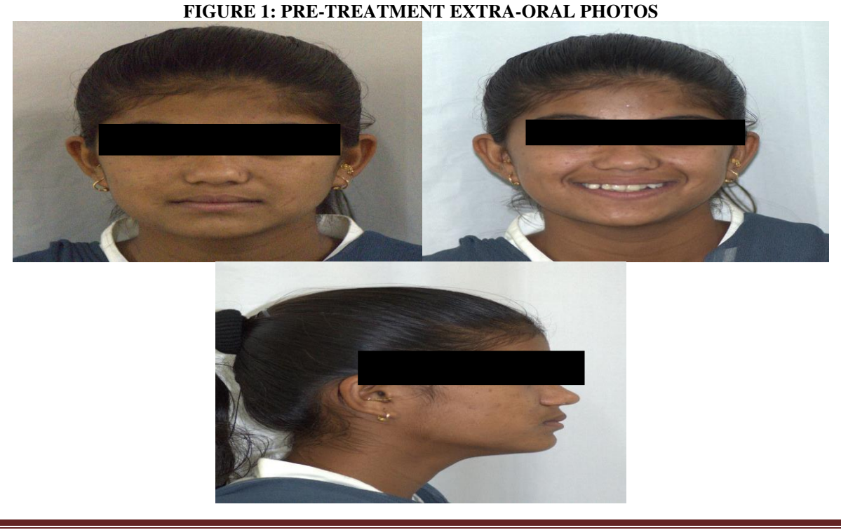
International Journal of Health Sciences and Research (www.ijhsr.org) Volume 14; Issue: 7; July 2024

The facial aesthetic was improved with better lip support and improved nasolabial angle (Fig. 6-7). The smile was enhanced and the consonant smile arc was achieved. Intraorally, ideal overjet and overbite was achieved with Class I molar and canine relationship. The panoramic radiograph taken just before debonding (Fig. 8) showed good overall root parallelism and lack of resorption. Pre-debonding root lateral cephalogram (Fig. 8) showed satisfactory improvement in ANB angle by 1° and improvement in mandibular position (SNB: 79°). The position of upper and lower incisors was improved, upper incisor at 22° and 4mm to NA and the lower incisor at 26^{\circ} and 6mm to NB with an IMPA of 101°. A favourable profile change in facial profile contoural angle was seen.