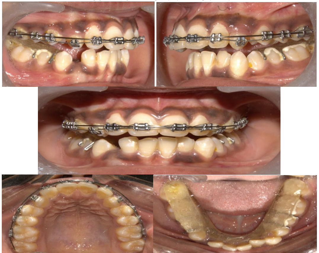
FIGURE 4: UPPER CANINE ALIGNMENT