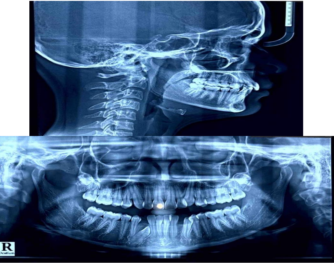
FIGURE 3: PRE-TREATMENT CEPHALOGRAM AND OPG

FIGURE 2: PRE-TREATMENT INTRA-ORAL PHOTOS