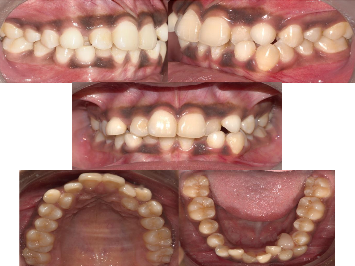
FIGURE 2: PRE-TREATMENT INTRA-ORAL PHOTOS