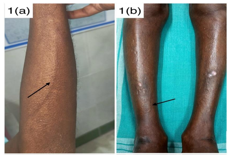
Fig.1a- Indentation of skin along the course of superficial veins along forearm (black arrows). Fig.1b- Indentation of skin along the course of superficial veins along both the legs (black arrows).

Patient was started with oral prednisolone 1mg/kg/day at tapered doses combined with oral methotrexate at a dose of 10mg/week and topical tacrolimus 0.1% ointment after which the patient had significant improvement in skin thickening.