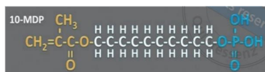
Fig 1 chemical structure of 10-MDP