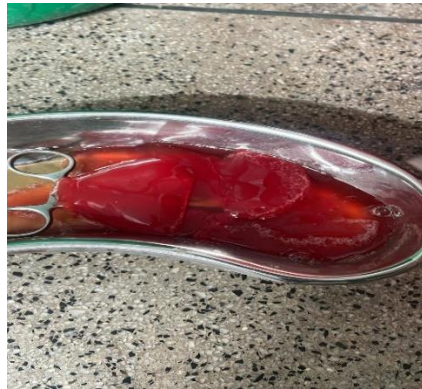
Figure 2: Blood clots with serum drained from left pleural cavity