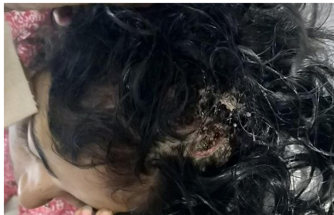
Fig. 1a&b)-shows lacerated scalp wound infested with multiple larvae.

blood sugar was slightly raised. MRI showed no intracranial extension or osteomyelitic changes (Fig2). After applying turpentine liniment, approximately 40 larvae were removed from the wound. Surgical debridement and daily dressing of the open wound was advised and a prophylactic course of antibiotics was started for two weeks. Unfortunately, the morphology and the species of the maggot could not be identified. The patients' relatives were educated regarding scalp care and personal hygiene. She was asked to come for review every 2 weeks at the dermatology outpatient clinic.