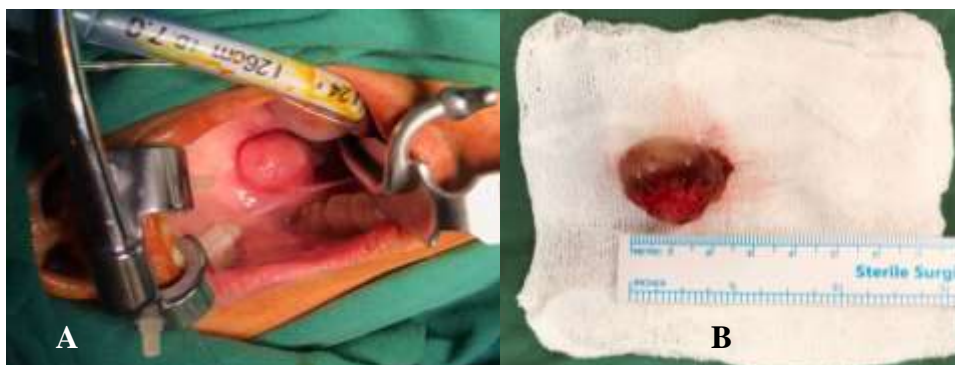
Fig 3. A) Intraoperative clinical pictures, B) The right soft palate mass size ranges from 2.54 x 2.19 x 2.19 cm

looks like a white mass fills the entire network in a definite margin. While in microscopic examination is a tissue that is partially covered by stratified squamous surface epithelium, some without surface epithelium. The tumor mass is surrounded by a fibrous connective tissue capsule, of varying thickness, composed of proliferating neoplastic cells that form solid, glandular-like, trabecular, and microcystic structures.