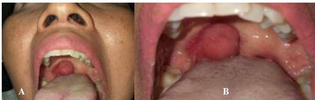
Figure 1. Pre-operative intra-oral clinical pictures. A) Revealed lesion in the right soft palate, B) The size of the lesion was around 2 × 2 cm

weight loss stated by the patient. Physical examination demonstrated a well-developed and well-nourished woman in no distress and no lump felt in the area around the neck. Past medical history, such as diabetes mellitus, hypertension, and other immunodeficiencies were denied by the patient. The patient did not take any medication while experiencing complaints since those 6 months ago. The occupation as a housewife causing most of her daily activities are indoors. None of the patient's family suffers from similar complaints, or have a history of other cancers. This patient has no history of smoking and drinking alcohol. The results of the physical examination found the mass or lump on the right side of soft palate close to the peritonsillar area, an enlarged mass that was more red or erythematous in color than the surrounding oropharyngeal mucosa, smooth surface, not prone to bleeding, and no exudate. No palpable enlarged lymph nodes. Laboratory tests in the form of complete blood count, bleeding time (BT) and clotting time (CT), random blood glucose, liver function test (Serum Glutamic Oxaloacetic Transaminase and Serum Glutamic Pyruvic Transaminase), kidney function test (urea and serum creatinine) and electrolytes. X-ray supporting examinations in the form of a CT scan of the Coli region with contrast, and photos of the posterior anterior chest radiograph. After the excisional Biopsy is performed, the tissue is examined pathologically and anatomically.