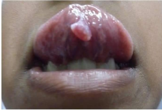
FIGURE: 2A. Showing single pea sized wart hanging below the tongue before treatment