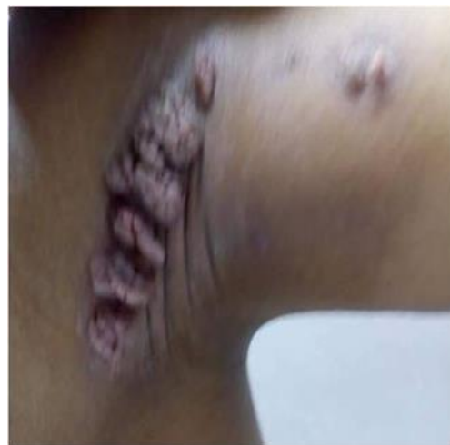
FIGURE: 3B. Showing size of cauliflower like growth reduced during treatment