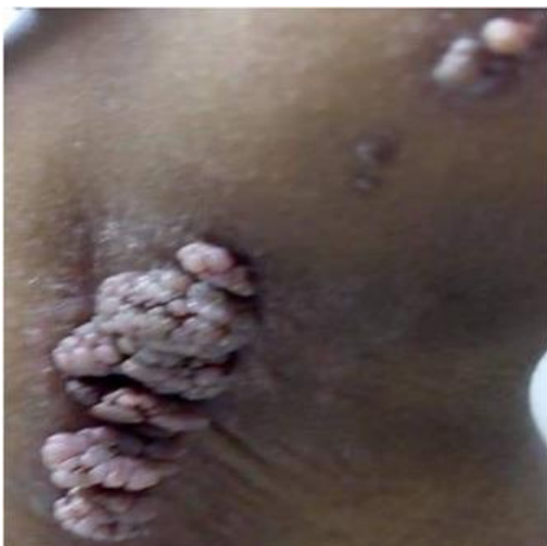
FIGURE: 3A. Showing multiple cauliflower like growth on the medial aspect of left axilla before treatment