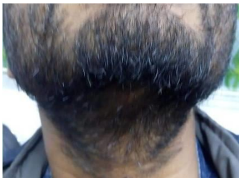
FIGURE 1B. Multiple warts gets clear after 7 months treatment.