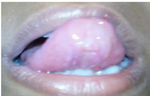
FIGURE: 2D. Oral mucosal warts get clear after 6 months treatment