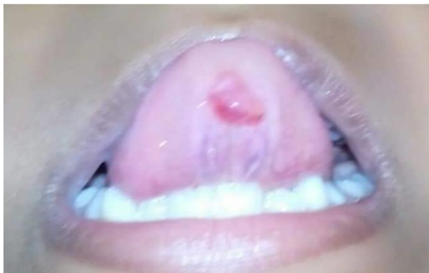
FIGURE: 2C. During treatment (phase 2) size of the wart is getting reduced