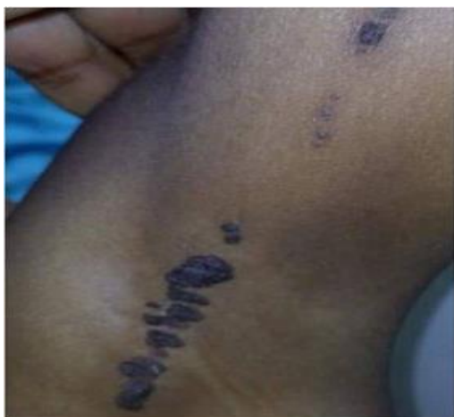
FIGURE: 3C. Cauliflower like growth leaving a hyper pigmented mark after 6 months treatment