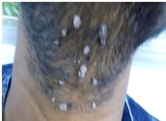
FIGURE 1A. Showing multiple warts below the chin at the muscular triangle area of neck before treatment.