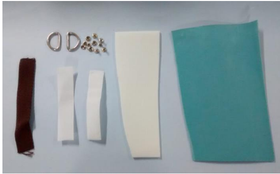
Fig 3: strapping and padding material