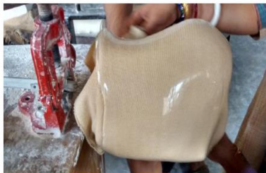
Fig 7: moulding

No specific modification was done. Only smoothening of the surface was done. Moulding was done by 4 mm. polypropylene sheet (Fig 7). After the moulding of head and shoulder piece it is trimmed in such a manner that both the