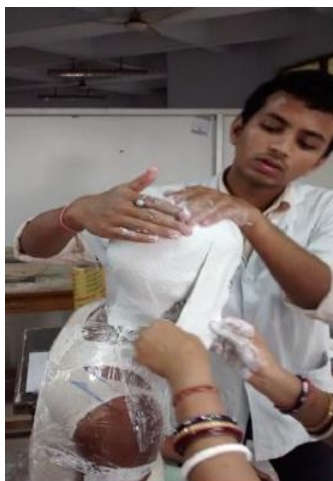
Fig 6: Casting