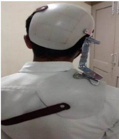
Fig 9: Subject with orthosis

After the attachment of D-ring and velcro strap, colourful Ethaflex is attached inside the helmet and shoulder piece for comfort and cosmesis.