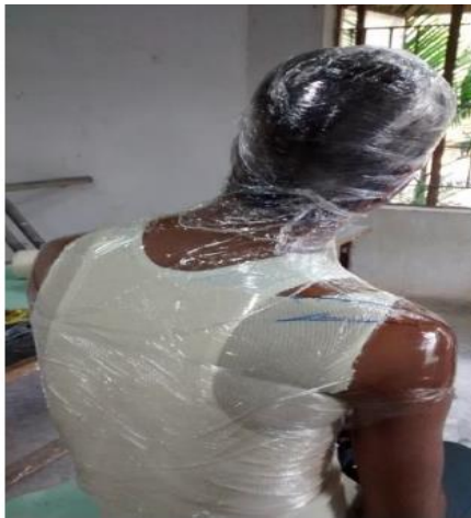
Fig 4: casting preparation

After assessment and evaluation following measurements were taken for the fabrication of the orthosis