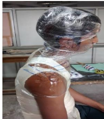
Fig 5: Marking landmarks