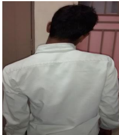
Fig 8: Subject without orthosis

In the proximal mount there is the provision for height adjustment and in the distal mount there is the provision for rotational adjustment. In between the proximal and distal mount, there is a connector which is responsible for antero-posterior and lateral angular adjustment. Size-I orthotic hip joint is used to make the connector and there is the provision for angular adjustment in 15 degree interval up to 60 degrees. Also there is a provision for locking at the joint in desired position. The 1 inch velcro straps were attached with the nylon webbing for proper suspension and adjustment over the head and shoulder.