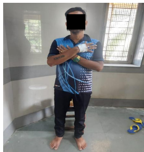
Figure 1 and 2 Assessment of 1-minute Sit to stand in COVID-19 patient.