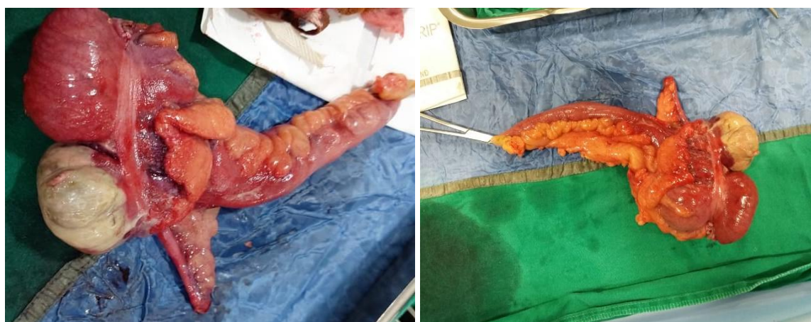
Image 3: image of the specimen dissected (part of ileum, caecum, appendix and part of ascending colon).

serosal hemorrhage show inflammatory infiltrate. Appendix, ileum and colonic cut margin shows no pathology.