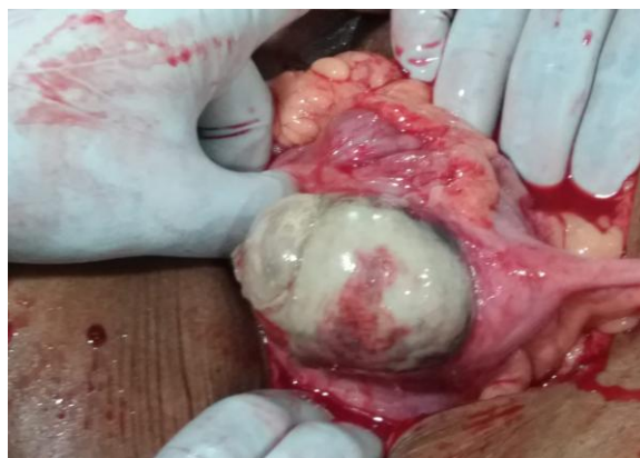
Image 2 : deliering cecum and appendix through laparotomy incision