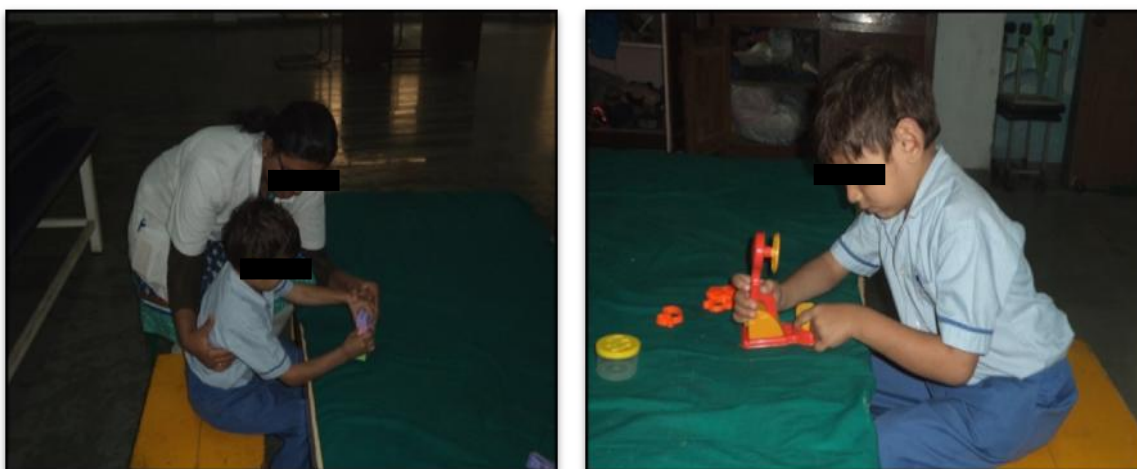
Figure 2: SUBJECT IN GROUP B- HABIT

Caregivers were asked to keep an exercise diary, to log the total period of practice done, restraint device worn per day and any issues arising from use of the glove. For subject in HABIT group care givers reported about how many hours' bimanual activities was done at home. Along with it, caregivers in both the groups reported about the activities done at home. Outcome measures were taken at the end of intervention and after 4 weeks of completing the intervention.