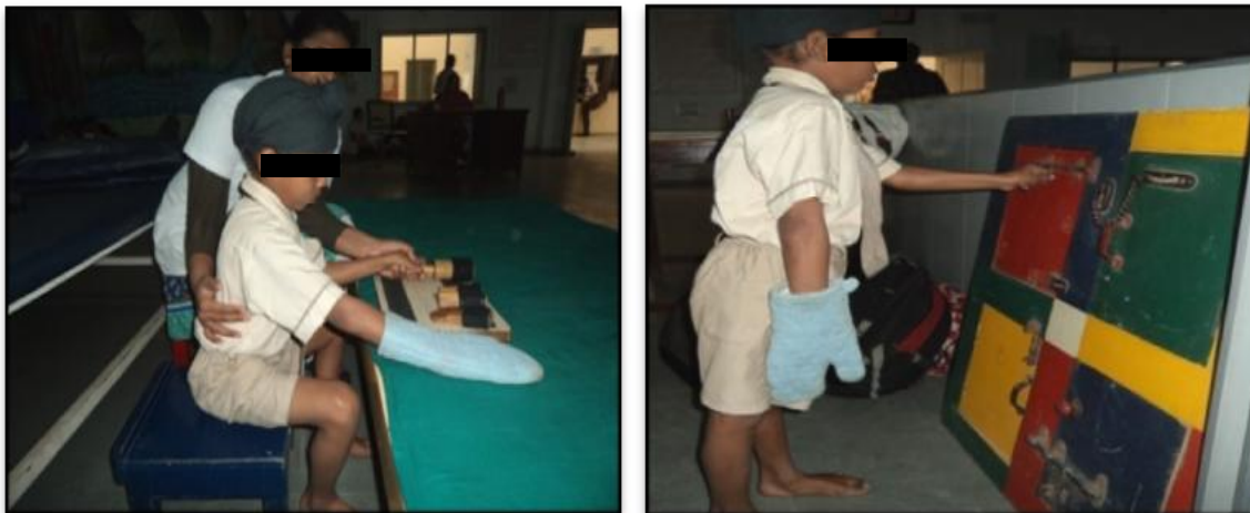
Figure1: SUBJECT IN GROUP A- MCIMT

cards, opening zip, putting beans in jar, playing with Velcro, peg board and opening door focusing on grasp, release and hold were practiced as mass practice repetitively.