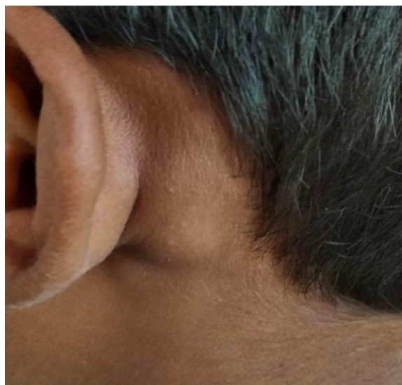
Figure 1-left postauricular swelling

Swelling was associated with intermittent low grade fever with anorexia and generalised weakness.