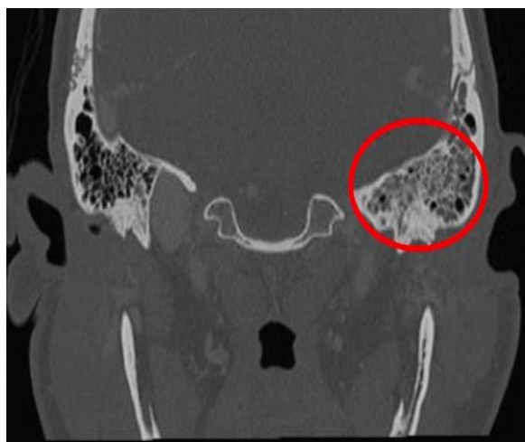
Figure 2-Left sided otomastoiditis on HRCT Temporal Bone

Pure tone audiometry result was bilateral moderate conductive hearing loss.