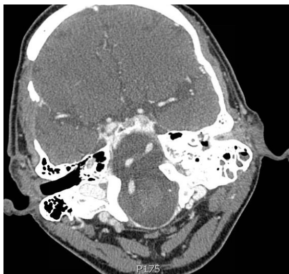
Figure 3- Hypopneumatization of left mastoid air cells with soft tissue and fluid density contents within.

HRCT temporal bone was suggestive of relative hypopneumatization of left mastoid air cells with soft tissue and fluid density contents within. Extension is seen into the entire middle ear through the aditus and antrum suggestive of oto-mastoiditis.