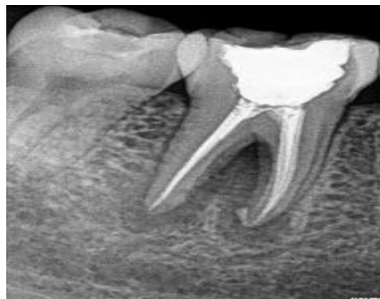
Fig. 3 post-obturation radiograph