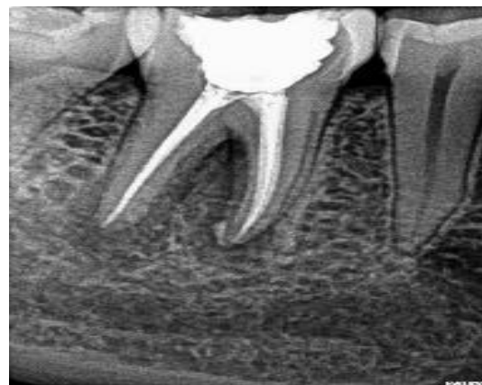
Fig. 4 radiograph at 3 months follow-up

At 3 months follow up examination, the tooth was non-mobile and radiographic examination revealed healing lesion (Fig. 4). At 12 months follow up examination, radiograph revealed healed periapical lesion. Radiolucency in the furcation region has also disappeared (Fig. 5).