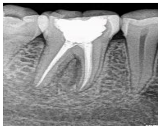
Fig. 5 radiograph at 12 months follow-up