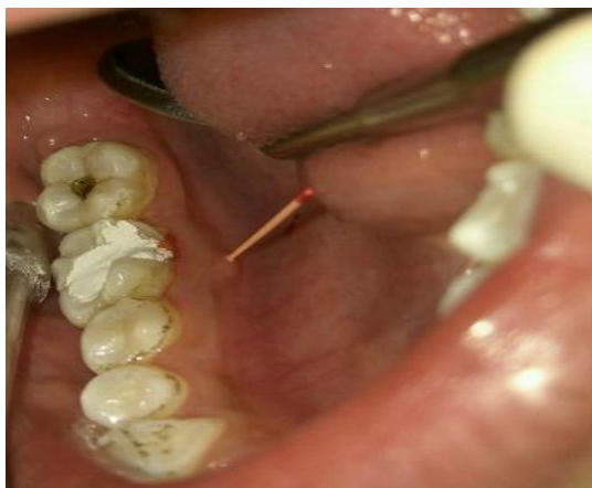
Fig. 1 Sinus tracing using gutta-percha cone

intraoral sinus opening was seen on the lingual aspect in relation to the same tooth. On periodontal probing, normal probing depth was found. Radiographic examination revealed a pre-accessed tooth with well-defined periapical lesion along-with a radiolucency in the furcation region of 46. The sinus tract was traced using a no. 25 gutta-percha cone (Fig. 1). Radiograph revealed the sinus tract to be associated with the furcation of the tooth 46 (Fig. 2). Tooth was found to be non-vital after performing pulp vitality test. Endodontic treatment was administered in 2 visits. After proper cleaning and shaping a calcium hydroxide dressing was placed. After 7 days the sinus opening disappeared and mobility reduced to grade 1 mobility. After removing temporary filling and proper irrigation and removal of calcium hydroxide dressing, obturation was performed using cold lateral compaction and a permanent composite restoration was placed (Fig. 3).