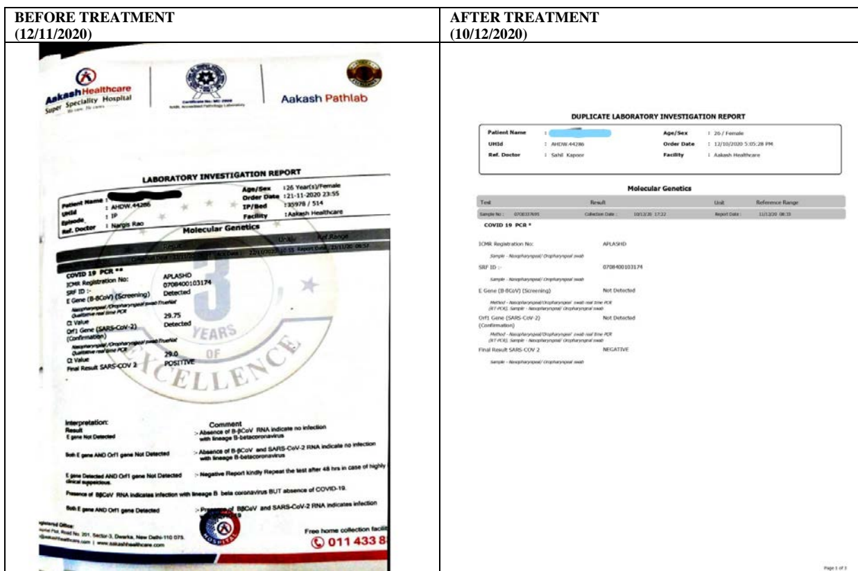
FIGURE 1: COVID-19 DETECTED BY RT-PCR

There was resolution of symptoms gradually, and there was no progression of the disease to a severe stage. There were no adverse or unanticipated events.