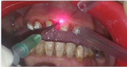
Fig.9 : application of the diode laser