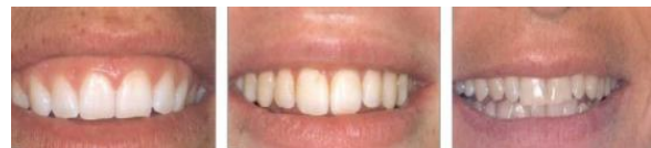
Fig.1 : smile lines respectively high, medium and low