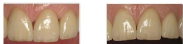
Fig.4 : absence of papilla around the 21 (left), and recovery to the physiological state (right)

Important considerations in terms of smile esthetics are the height/width ratios of clinical crowns, as well as the appearance