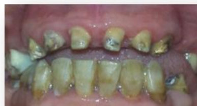
Fig.7: Removal of the temporary prosthesis showing short support teeth