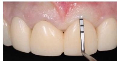
Fig.5: evaluation of the biological space