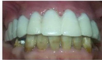
Fig.13 : new provisional prosthesis in place (note the clear increase in height of the prosthetic crowns and the improvement of the esthetic aspect of the prosthesis)