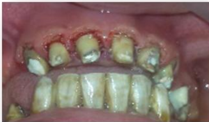
Fig.10: immediate postoperative status (note the excellent hemostasis)