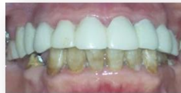
Fig.6: anterior provisional prosthesis : note the anesthetic aspect of the prosthetic crowns due to insufficient height of the teeth