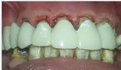
Fig.11: old temporary prosthesis in place (note the gain in height after gingivectomy)