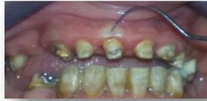
Fig.8 : preoperative evaluation of the biological space and the attached gingiva