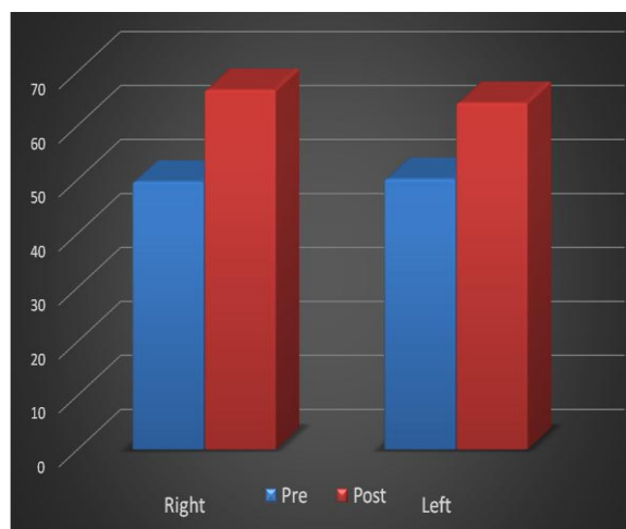
Graph 1: Comparison between pre & post-test mean scores of Bilateral PHA test (degree)