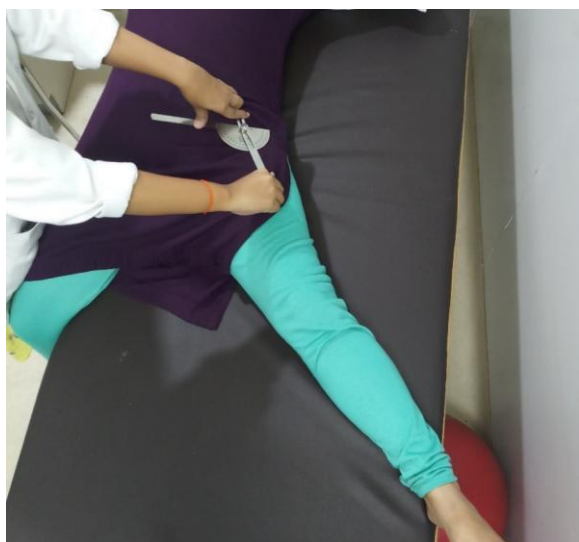
Fig 2: Post-treatment evaluation, PHA test