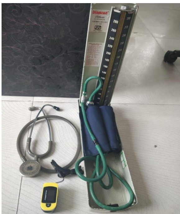
Fig. 2: Apparatus used in the study.