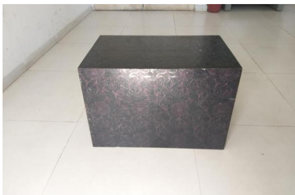
Fig. 1: Queen's college step stool of 16.25 inches (41.3cm) height

metronome, weighing machine, sphygmomanometer, pulse oximeter, chair, pen and paper.