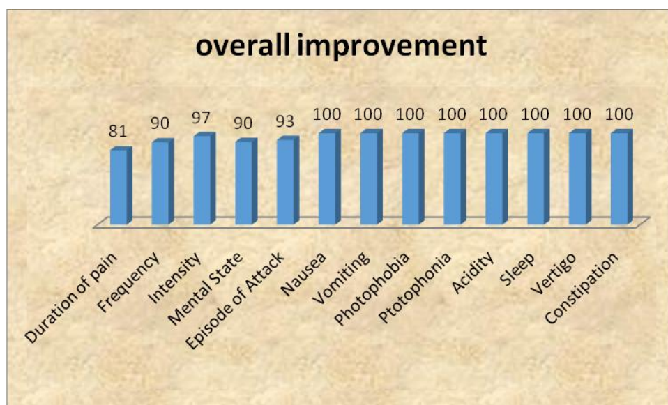
Fig no. 2 OVERALL IMPROVEMENT WITH HOMOEOPATHIC TREATMENT

The fig no 2 suggests that in 100% of the total population the signs which got relief were Nausea, Vomiting, Photophobia, Photophonia, Acidity, Sleep, Vertigo and constipation on the other hand 93% of the total population in Episodic attack, 90% of the population got relief in Mental state, 97% of the population got relief in the intensity of pain 90% of population got relief in frequency of the symptoms and 81% of the population got relief in the duration of pain overall it was seen that treatment with homoeopathic medicine over the period 1 year showed significant decrease in the sign and symptoms of migraine and also much better than that of allopathic medicine.