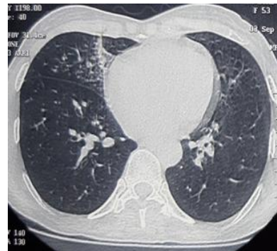
Figure 4: CT thorax-Right middle lobe air space opacity.

On examination, she had mild fever. There was visible difficulty in breathing with use of accessory muscles and inspiratory stridor (Fig 1). There were no palpable lymph nodes or visible swelling in neck. Heart sounds were normal except for tachycardia. Her abdominal and neurological examination was unremarkable. ENT examination showed no abnormality. Indirect laryngoscopy showed bilateral vocal cords normal in appearance and equally mobile. Her routine blood investigations revealed no eosinophilia and Arterial blood gases was unremarkable. Sputum for geneXpert was negative for mycobacteria and culture revealed normal oral flora. Serological tests ruled out ABPA and vasculitis. An urgent chest X ray was grossly normal (figure 2). Contrast enhanced computed tomography(CECT) of neck and thorax revealed a moderately enhancing isodense lesion measuring 18*19*28 mm in size in upper part of trachea at level of T1 vertebral body with marked luminal narrowing and right middle lobe consolidation( figure 3 and 4). CECT abdomen and pelvis was normal. Pulmonary