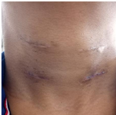
Fig.5 post op picture after two weeks

Second case is a female child of 6yrs with history of fistulous opening in neck