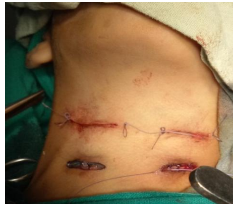
fig.4 per operative picture post excision of fitulous