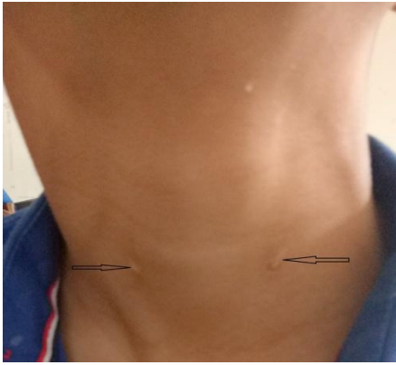
Fig.1 pre-op picture showing bilateral Fistulous opening