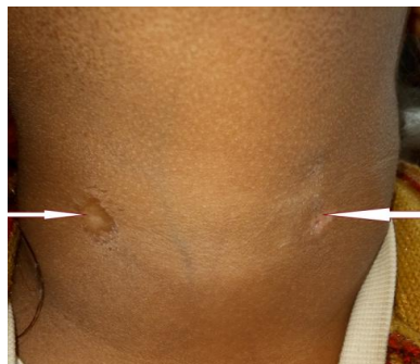
Fig.6 2 nd case with bilateral fistula

since birth. History of mucoid discharge from both the openings was present. On examination active discharge could be seen from both openings. Oropharyngeal examination was unremarkable. Pinna was showing grade two microtia in Rt. ear. Canal was patent. In lt. ear there was preauricular cartilaginous tag. pure tone audiometry was normal bilaterally. Ultrasound was showing no anomaly in bilateral kidneys. CT fistulogram was showing fistulous track with internal opening at the level of tonsils bilaterally. The patient was operated for bilateral fistula under GA.