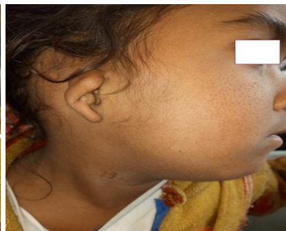
Fig.7 Rt ear microtia