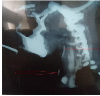
Fig.2 CT fistulogram showing fistulous track