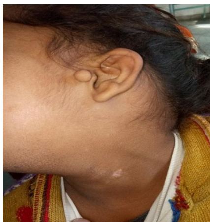
Fig.8 Lt. ear preauricular tag