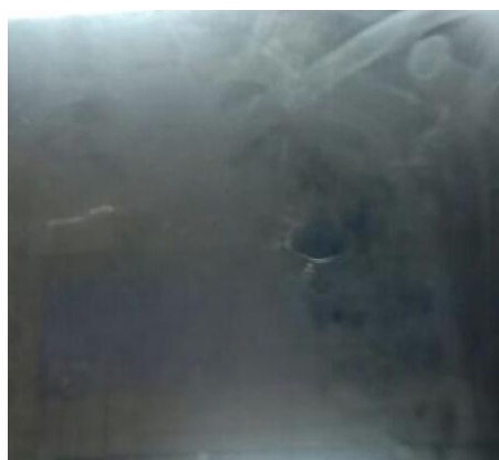
Figure 1: AP view chest x-ray (26/6/20) Bilateral patchy consolidation Rt > Lt

On considering patients comorbidities, charts were screened daily for blood glucose and blood pressure during the exercise session. Rehabilitation along with ongoing medications in this patient had positive impact on glycemic and blood pressure control which accelerated patient's recovery. Due to extended hospital stay and severity of condition, patient had less hopes of recovery which was overcome by motivation and psychological support provided by physiotherapist.