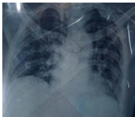
Figure 2: PA view chest x-ray (29/7/20) Bilateral minimal patchy infiltrates indicative of resolving ARDS